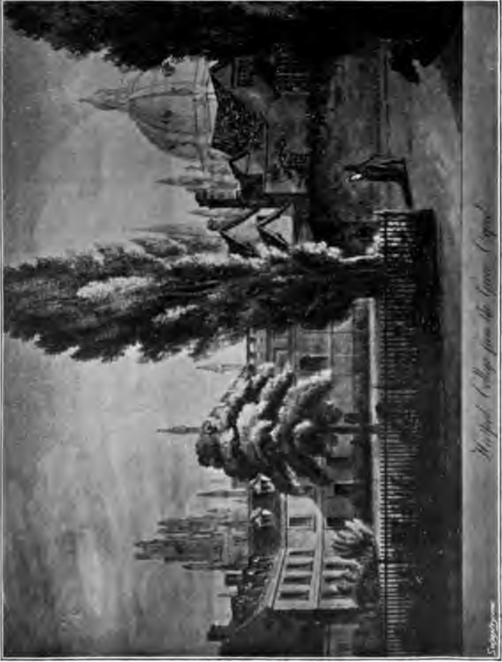
From a photograph by the